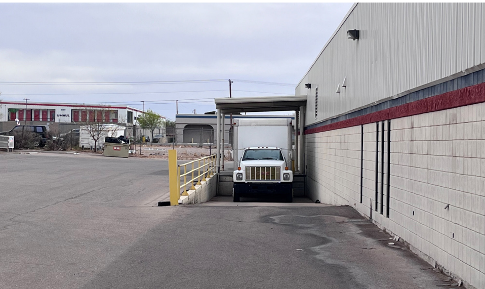
Independently Owned and Operated / A Member of the Cushman & Wakefield Alliance Cushman & Wakefield Copyright 2024. No warranty or representation, express or implied, is made to the accuracy or completeness of the information contained herein, and same is submitted subject to errors, omissions, change of price, rental or other conditions, withdrawal without notice, and to any special listing conditions imposed by the property owner(s). As applicable, we make no representation as to the condition of the property (or properties) in question.